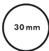
Main tube 30 mm